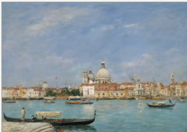
Eugène Louis Boudin, Venice, Santa Maria della Salute from San Giorgio , 1885, Oil on canvas, 18 1/4 x 25 3/4 inches, Museum of Fine Arts, Boston; Juliana Cheney Edwards Collection.